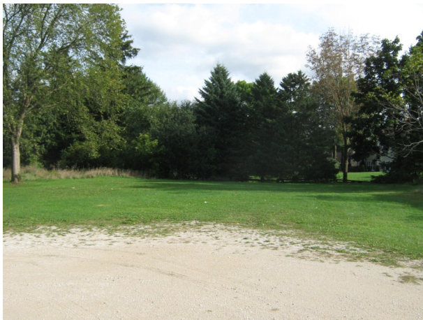
(above) Booths 43-49