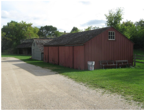
(above) Booths 50- 54 (51 & 52 inside)