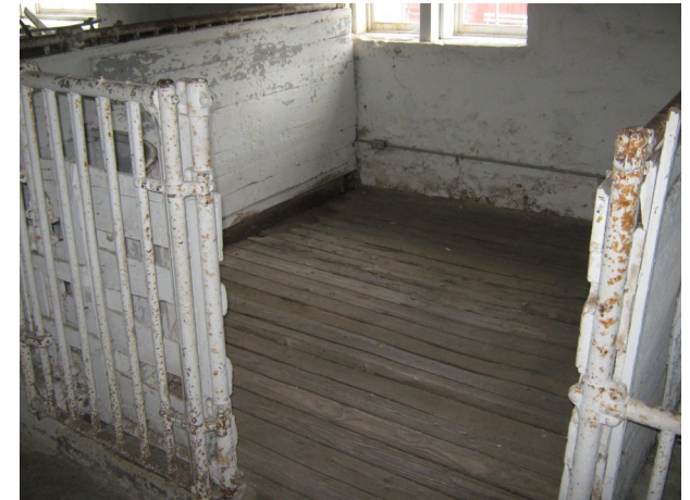
(above) Booth 71