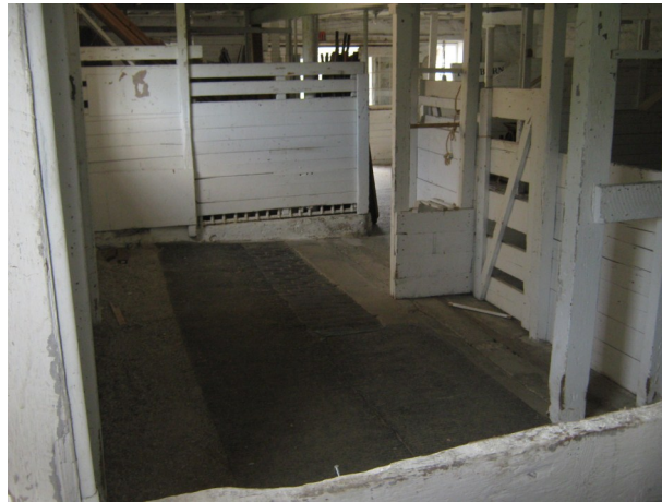
(above) Booth 94 & 95