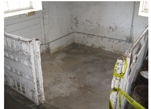
(above) Booth 70 (may have one table outside of booth as it is slightly smaller)

Note: These photos act as a general representation of booths inside the Stone Barn. As this is a historic farm park, the inside booths can be irregularly shaped and have a variety of flooring.