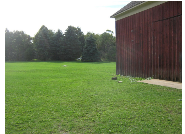
(above) Booths 106-110