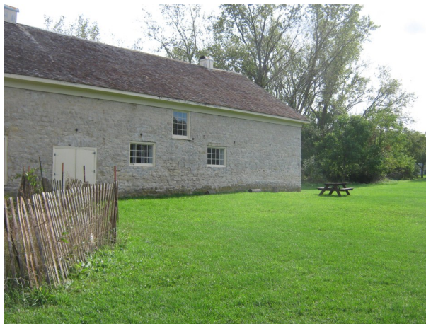
(above) Booths 99-105

Note: As this is a historic farm park, the grounds can be irregular and it is often difficult to determine where shade/sun will be.