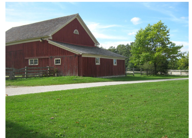
(above) Booths 120-125