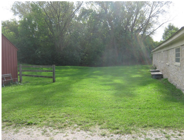
(above) Booths 55-69