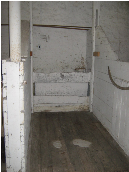
(above) Booth 81 & 82