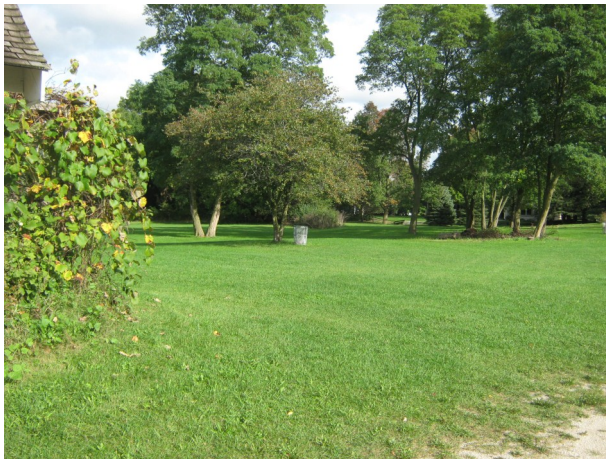
(above) Booths ~15-42